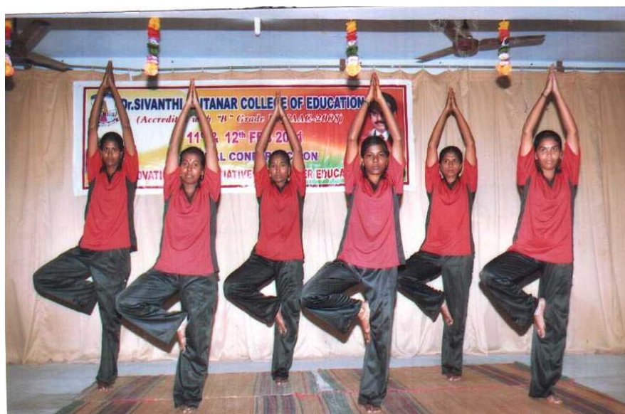
Students Exhibiting ASANA

Asana means holding the body in a particular posture to bring stability to the body and poise to the mind. The practice of asana brings firmness to the body and vitality to the body and mind. We offer yoga training to our students from 3.40 pm to 4.30 pm on every Friday for their well being.