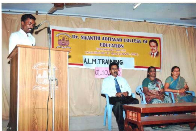
ALM Training On 01.10.2010