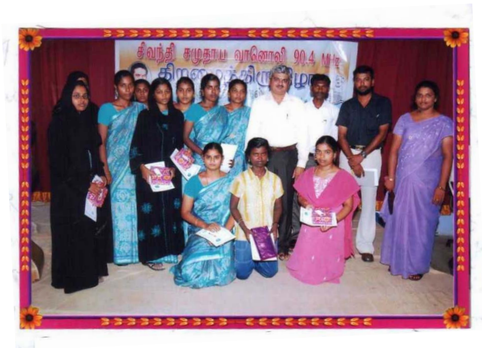
Prize Winners of Sivanthi Community Radio Talent Festival

The teaching, non teaching staff and students of our college presented various programmes related to arts, science and community development in the Sivanthi Community Radio, Tiruchendur. On 16.09.2010, one day and 11 girls were participated in 'Talent festival' conducted by "Sivanthi Community Radio" and they got one first prize, two second prizes and one third prize.