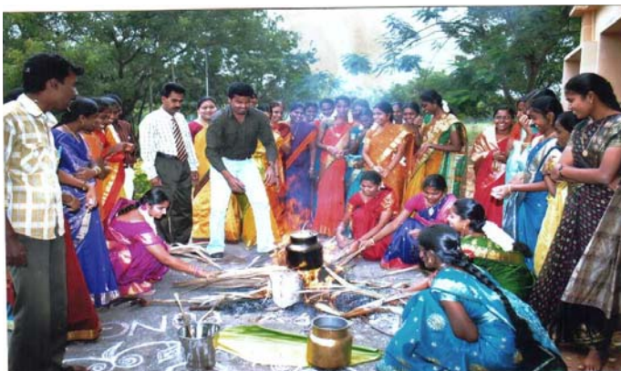
Pongal Festival – Celebration