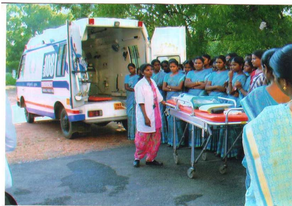
Programmes on Awareness of 108 Ambulance Service