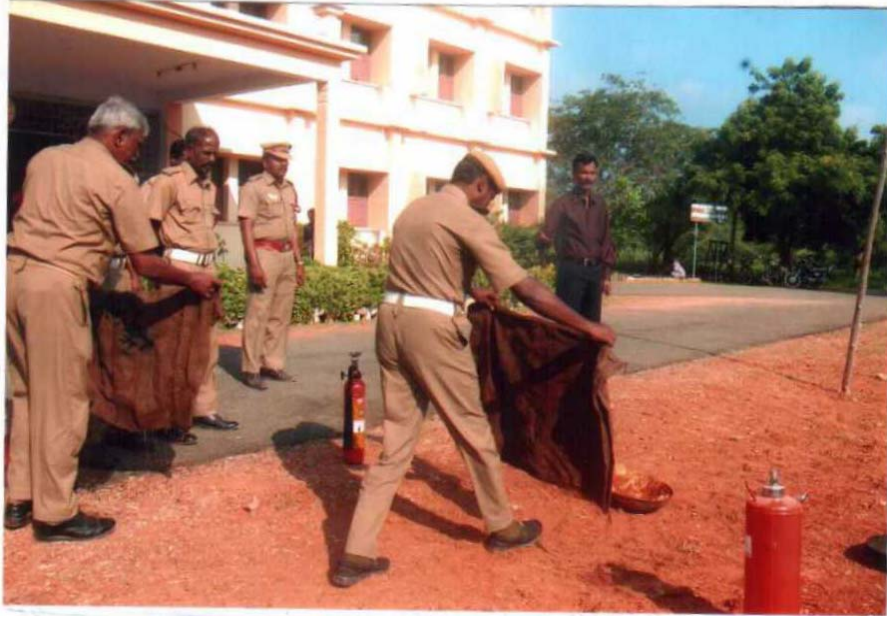
Safety Education Programme

As per the instruction given by Tamil Nadu Teacher Education University, our college conducted 5 days citizenship training camp to make our student teachers fit to be an ideal citizen of India. The various programmes such as leadership training, fire and safety management, Ambulance Services, Disaster Management, Health Education, Mental Health and Hygiene, Nature talky Traffic Rules and Regulation, 'Lifes' Fitness talk etc.