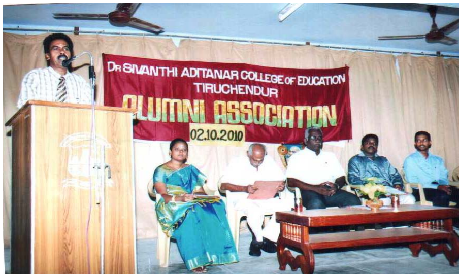
15 th Alumni Association on 02.10.2010

The suggestion given by the association are as under:-