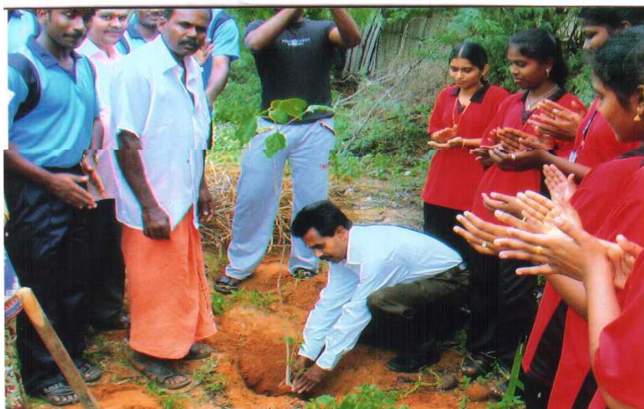
Sapling of trees at Gandhipuram

To create an awareness on the environment our 'Enviro-clule' planted around 25 trees on the day of community work which was held on 16-12-2010 at one of the rural backward village Gandhipuram which is situated near our college.